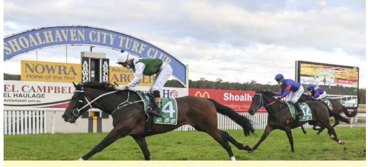
THE SOUTH COAST'S FRIENDLIEST RACE CLUB